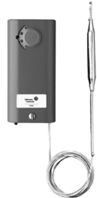
A28AB-29 Temperature Control